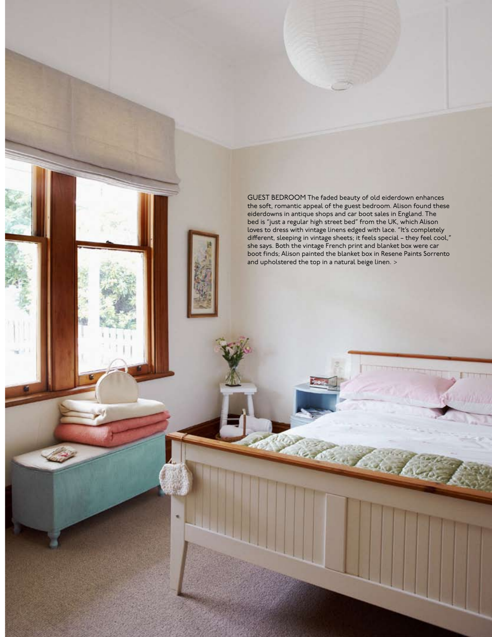
GUEST BEDROOM The faded beauty of old eiderdown enhances the soft, romantic appeal of the guest bedroom. Alison found these eiderdowns in antique shops and car boot sales in England. The bed is "just a regular high street bed" from the UK, which Alison loves to dress with vintage linens edged with lace. "It's completely different, sleeping in vintage sheets; it feels special – they feel cool," she says. Both the vintage French print and blanket box were car boot finds; Alison painted the blanket box in Resene Paints Sorrento and upholstered the top in a natural beige linen. >